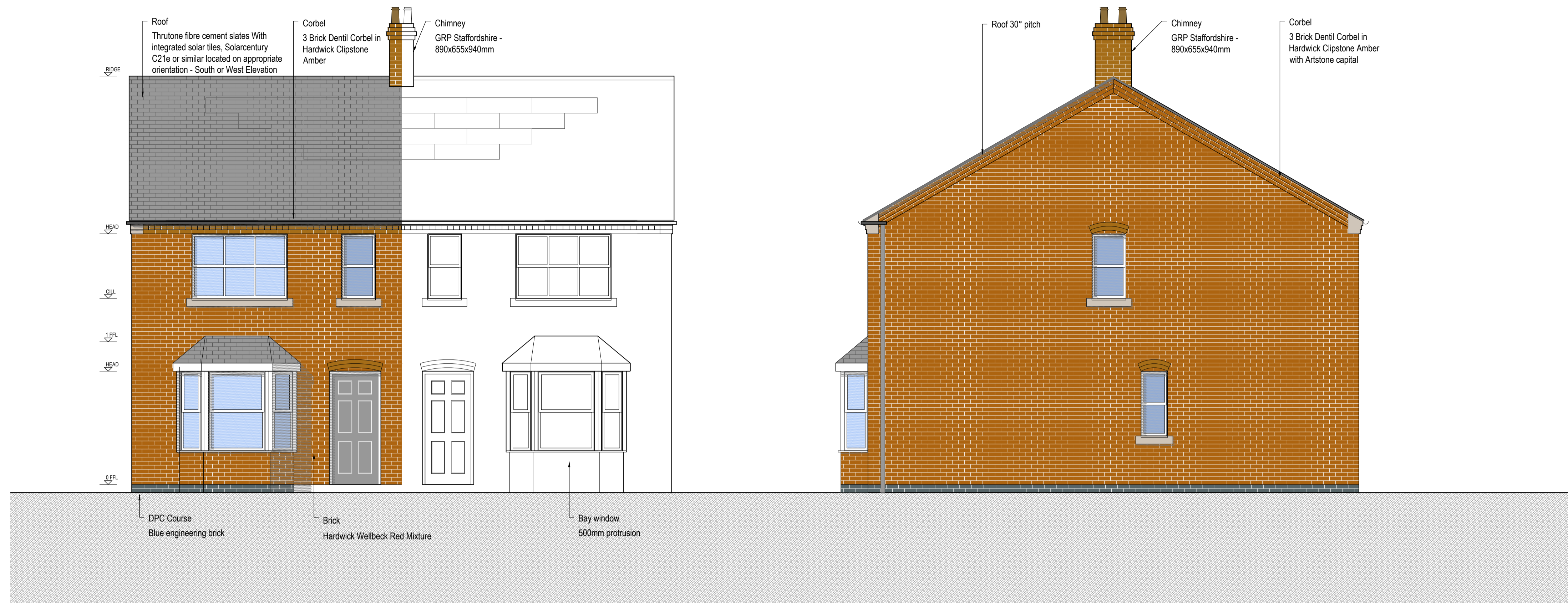
A Front Elevation